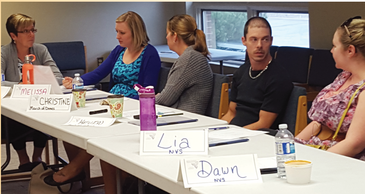
Employment Service Training with March of Dimes Canada - Sudbury, July 2016

As we continue to build capacity at ODEN, we will be able to meet the increasing demands of our sector and ensure we meet the goal of ensuring people who have a disability have full access to the labour market.