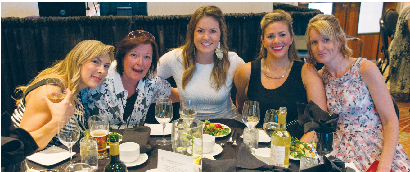
Community Living Sarnia Staff - 2016 RDC Conference Gala - Richmond Hill, June 2016

Addressing the need to engage people who have a disability at a much younger age, in terms of preparing them for employment, ODEN has delivered a number of presentations to family groups and school boards this past year. This work will continue into 2017/18.