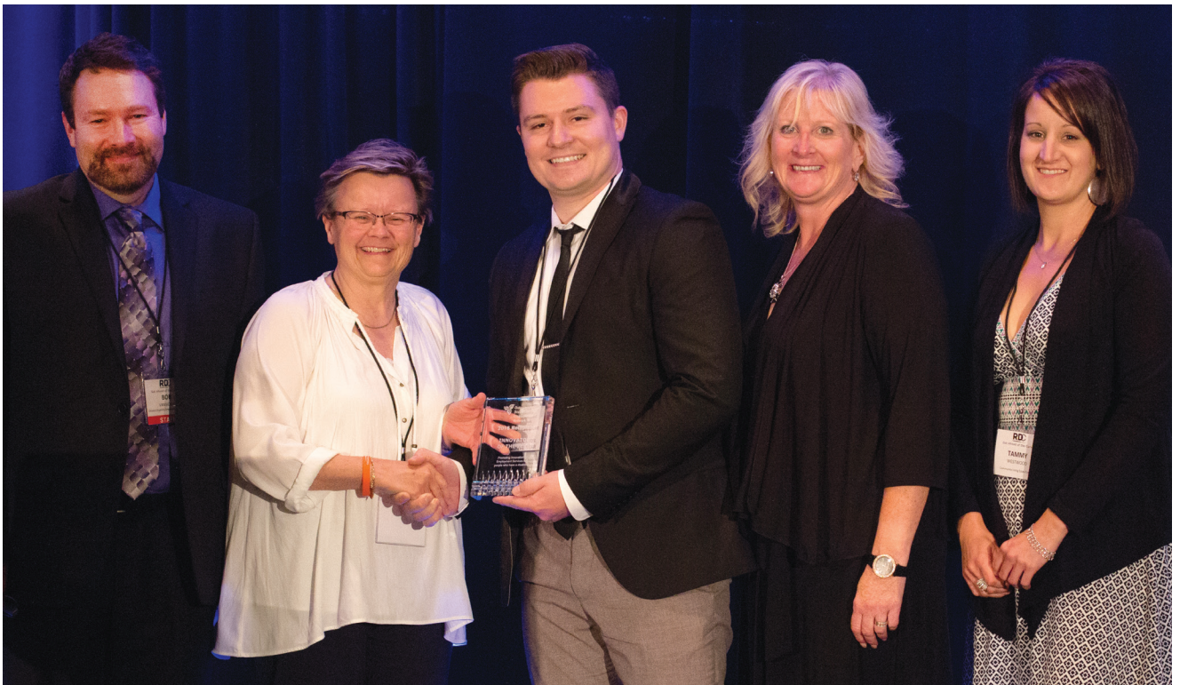
Innovator of the Year Award 2016 - Community Living Essex County - Career Compass

ODEN also anticipates continued involvement in the roll out of the Province's Employment Strategy.