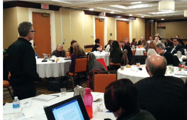
Regional X-Country Check-Up - Mississauga, March 2017

We worked with a number of DS employment agencies to create a new employment network in the North Bay and surrounding area – the North East Employment Network (NEEN).