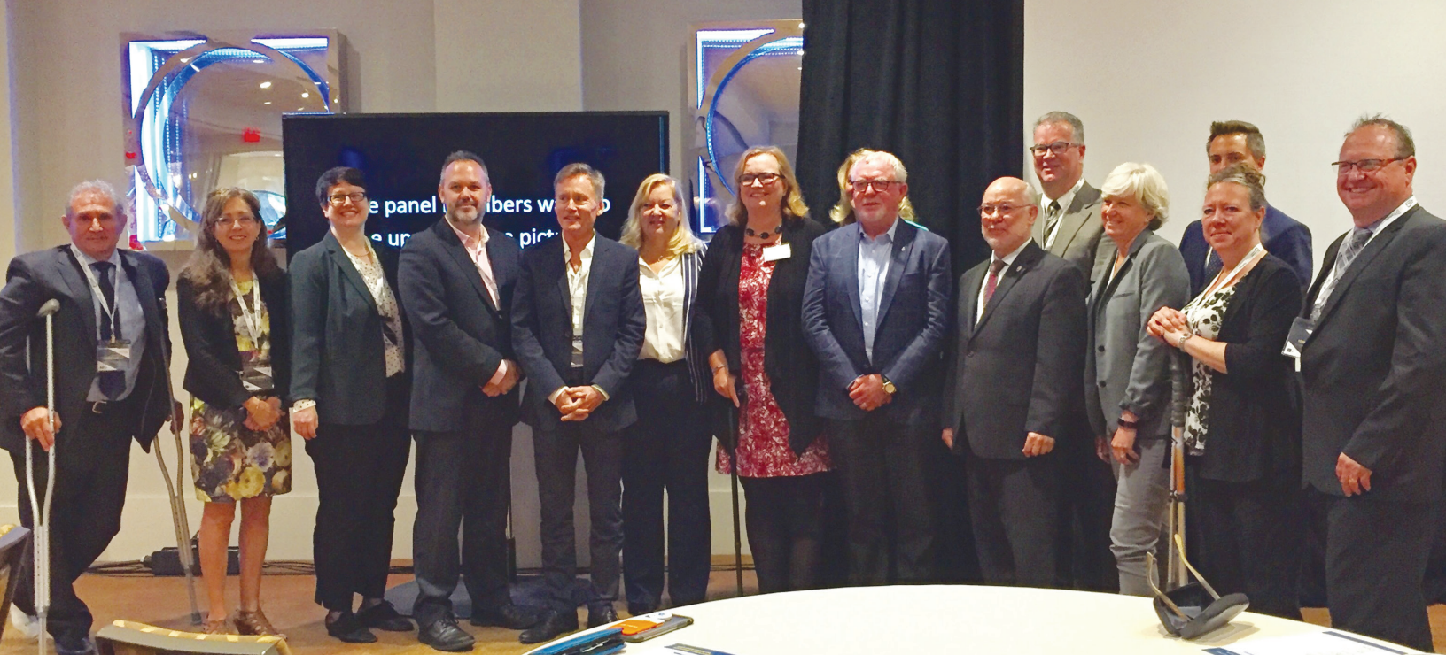
Employer's Partnership Table - Toronto, September 2017