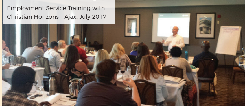
Employment Service Training with Christian Horizons - Ajax, July 2017

Ministry's transformation agenda as it relates to sheltered workshops.